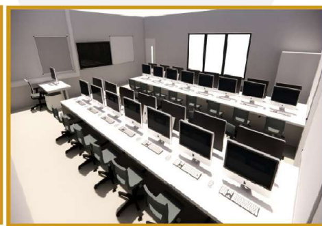
Purpose built IT suite (Ground Floor)