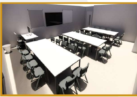
Purpose Built General Classroom (Floor 1)