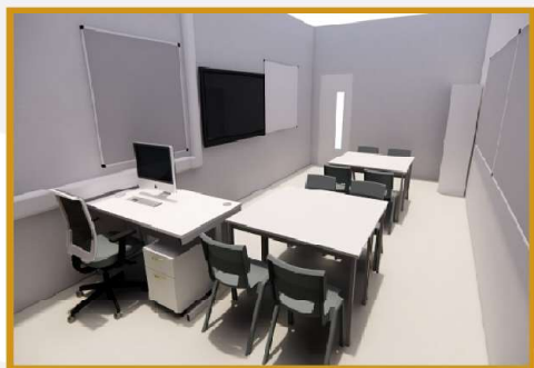
Purpose built intervention room for SEND (Ground Floor)

Below are some 3D images of the outcome of the construction work that is currently taking place.